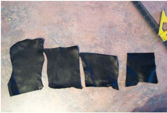
Four pieces of the wallet