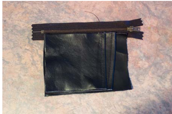
first side of zipper is done