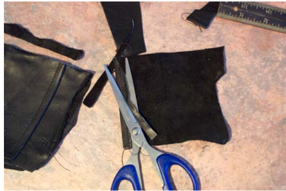
Cutting inside edges of the pockets