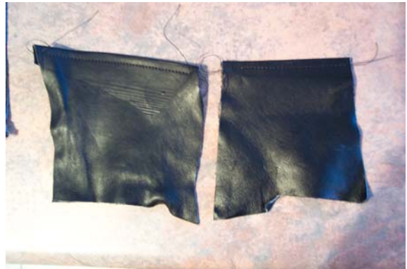
Both Pockets Together