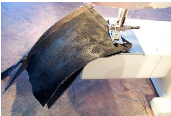
Sewing around the edges/round corners