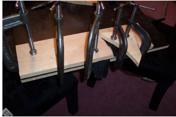
Wet Leather in the press