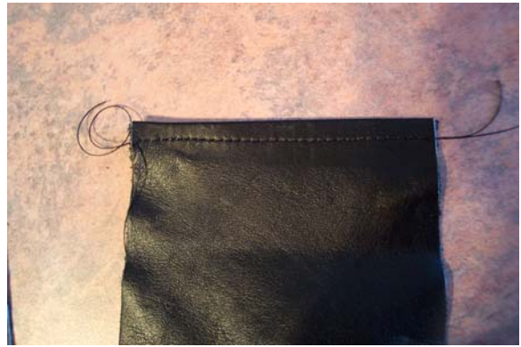
Sewn edge of the knife pocket