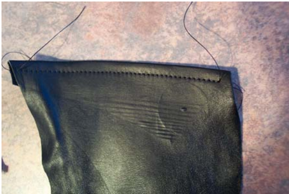
Larger card pocket