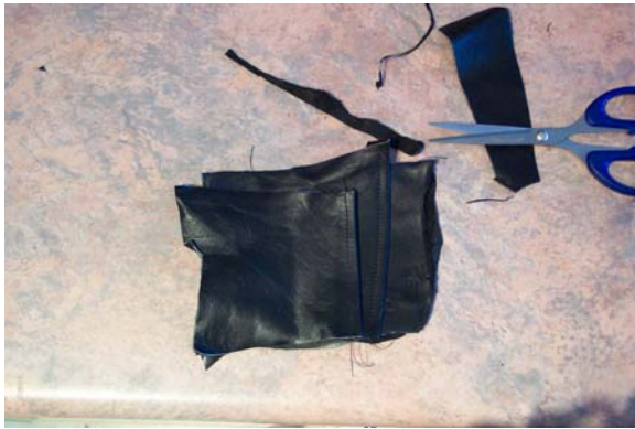
All the layers together