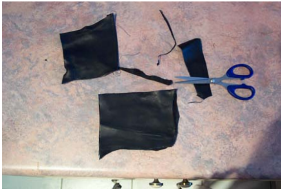
Clean up the edges and align