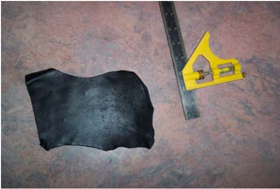
Sample piece of leather